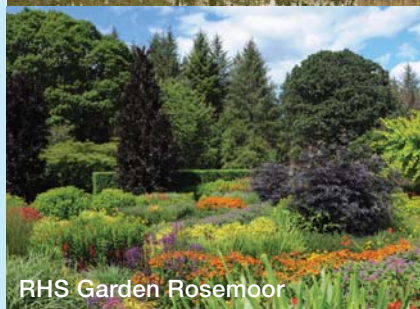
RHS Garden Rosemoor