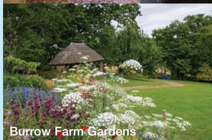
Burrow Farm Gardens

5 days from £549 Departing 26th May 2023